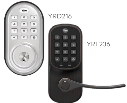
Both available in nickel or bronze finish

Hotels have made keyless entry the standard. VRMs installing smart locks are giving guests the safety and convenience they expect while making their operations more efficient.